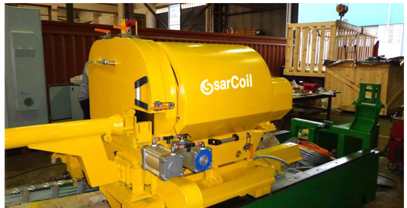
CUT OFF SAW