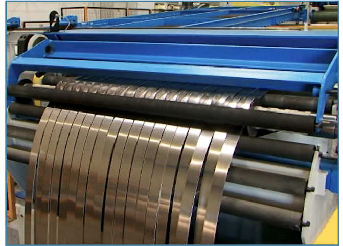
Project for increasing the productivity and personnel reduction. Replacement of existing separator shafts with automatic separator shafts