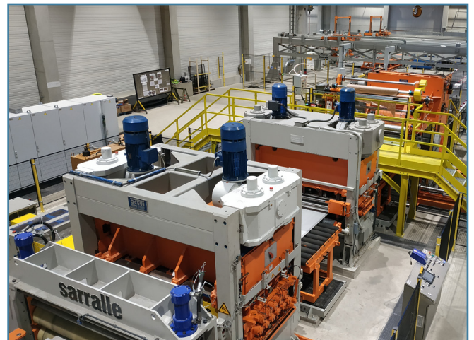
Revamps of complete lines and electrical and automation upgrade.