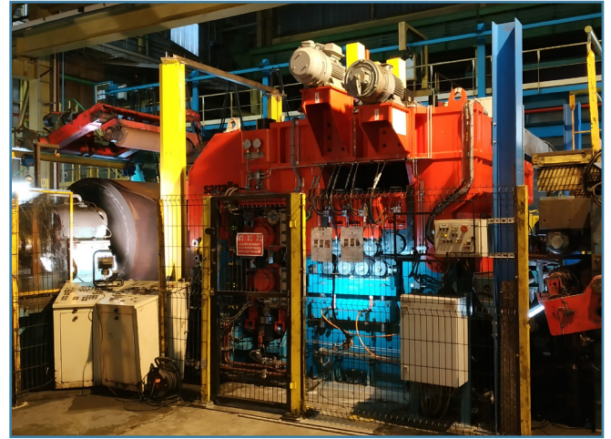
Process line capacity increase: Replacement of the entry area to increase the yield strength and thicknesses processed.