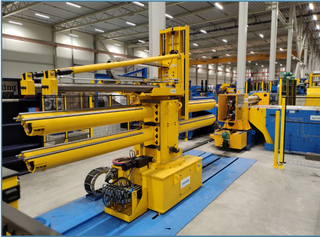
Slitting head substitution projects. Replacement of slitting heads with slitter and tooling capstan and integration of tooling robots.