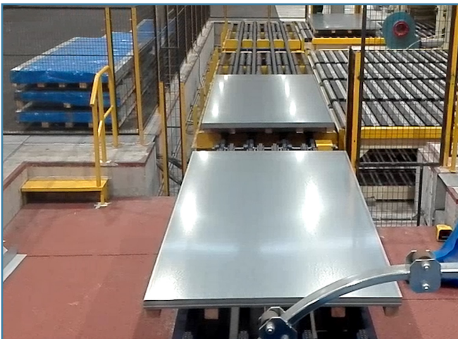
Bundle and slit packaging line modifications for product possibilities or increasing productivity