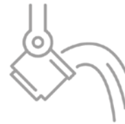
Steel Melting Plant